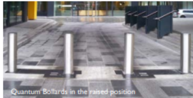
Quantum Bollards in the raised position