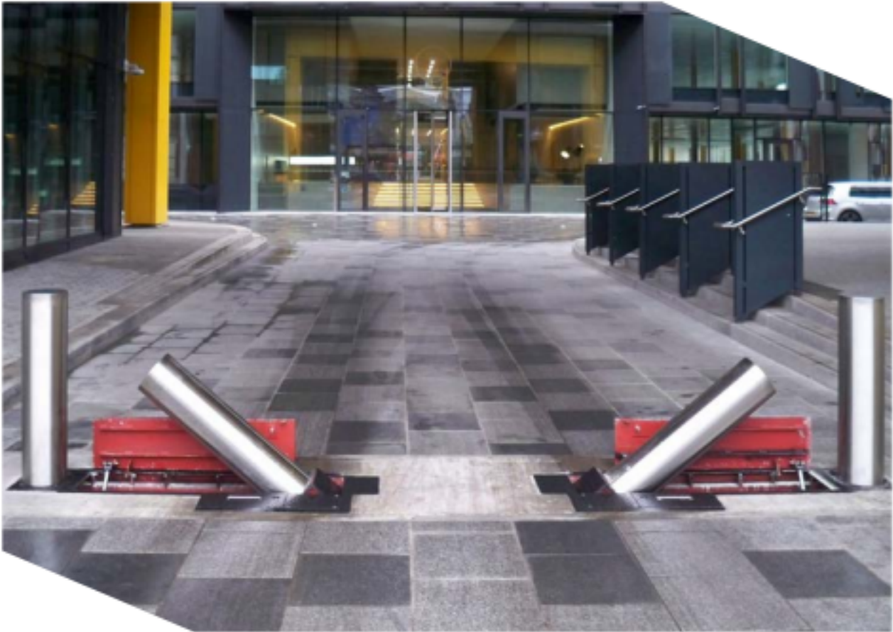
Pictured here as a Dual Terra Quantum Bollard system